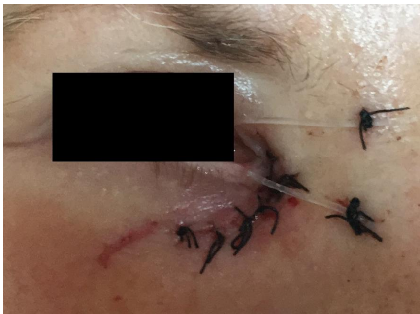
Figure 2. Condition after silicone double-channel tube placement; the photograph is used with the permission of the subject