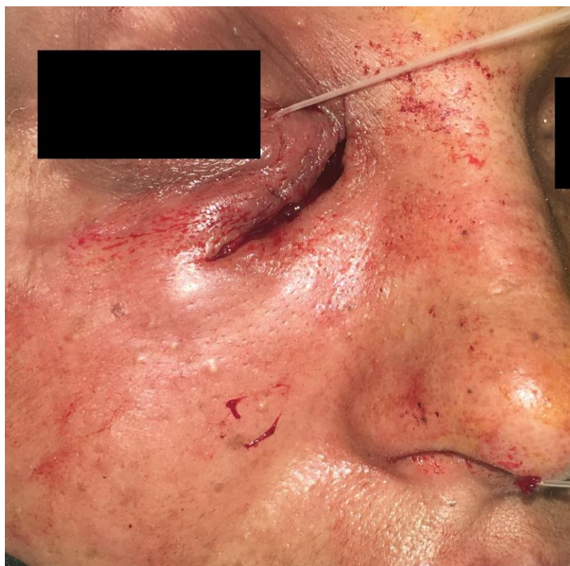
Figure 1. Condition after silicone single-channel tube placement; the photograph is used with the permission of the subject