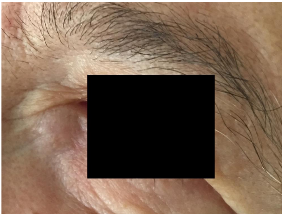
Figure 3. Chronic form of dacryocystitis; the photograph is used with the permission of the subject