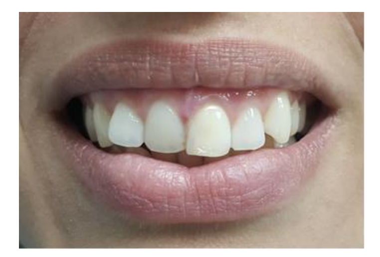
Figure 6. The same upper left incisor discolored by endo-sealer after intracoronal bleaching.