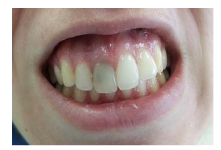
Figure 3. An upper right central incisor discolored by trauma before intracoronal bleaching.