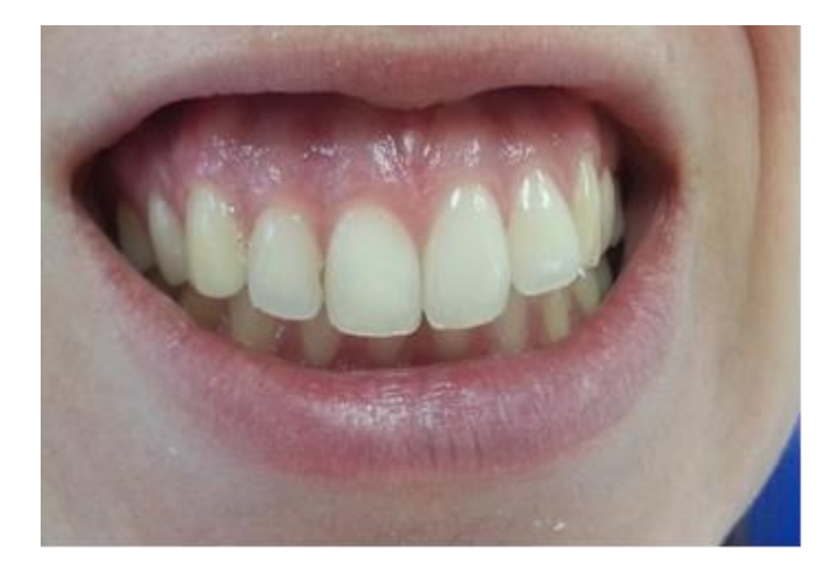
Figure 4. The same upper right central incisors discolored by trauma after intracoronal bleaching.