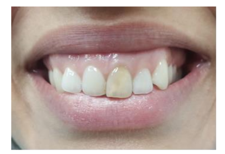
Figure 5. An upper left incisor discolored by endo-sealer before intracoronal bleaching.