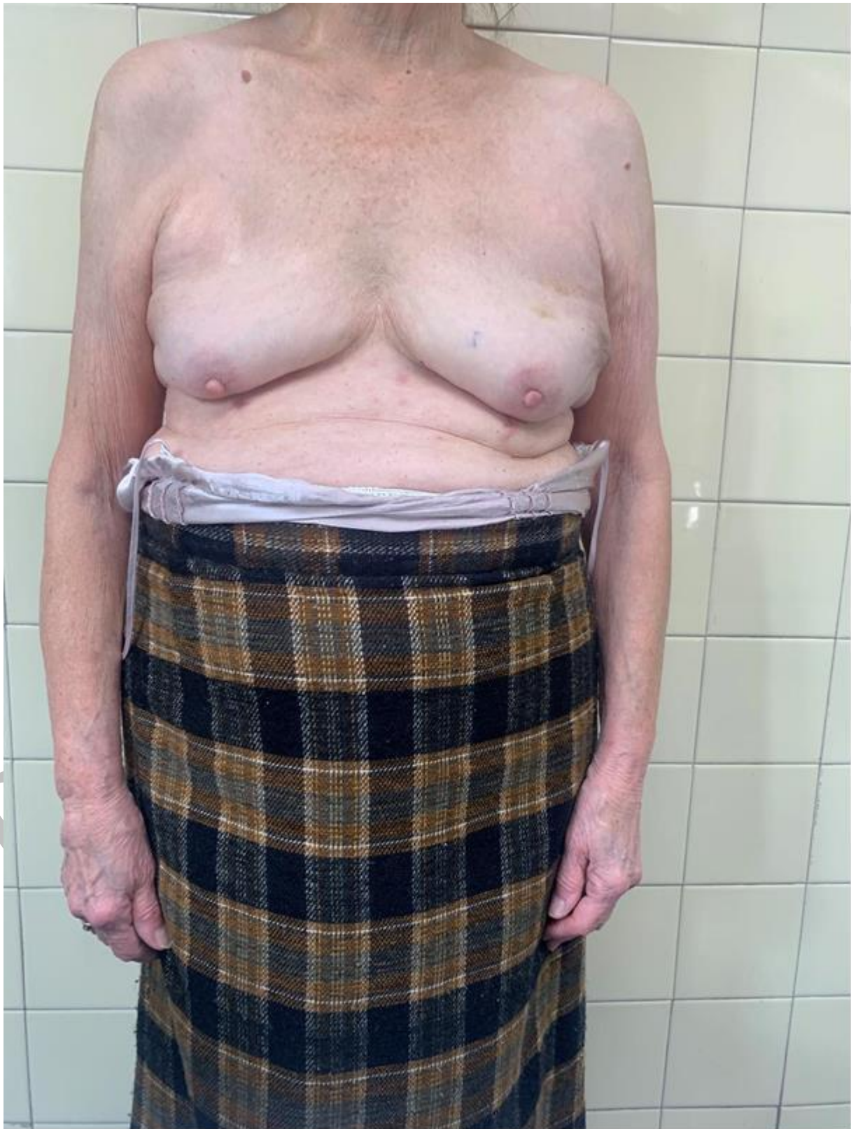
Figure 4. Postoperative follow-up