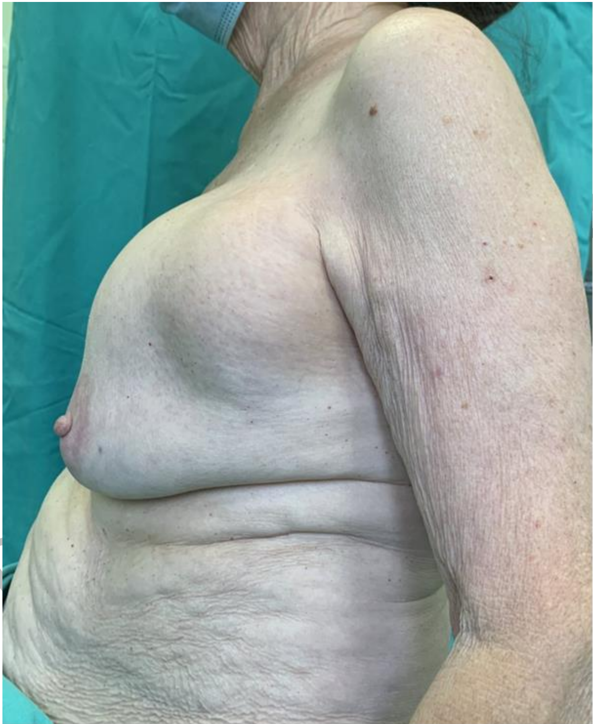
Figure 2. In the upper left quadrant, there was a tumefaction of about 5 \times 5 cm, insensitive to palpation, partially fixated, of hard consistency, without signs of inflammation present