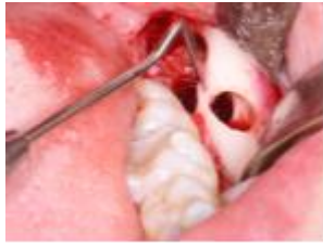
Figure 4. Bucco-distal bony bridge: using vestibular bone window technique, preservation of bucco-distal bony bridge was maintained