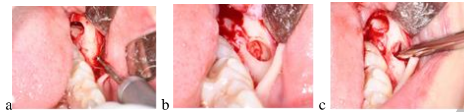
Figure 2. Surgical procedure for vestibular bone window technique: a and b – bone tunnel preparation; c – tooth extraction through bony window