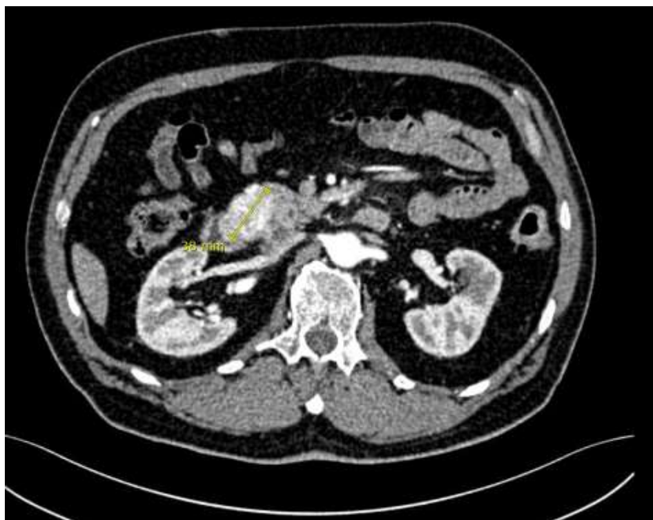
Figure 2. Abdominal computed tomography scan shows the tumor measuring 38 mm with uneven margins with possible infiltration of the pancreas