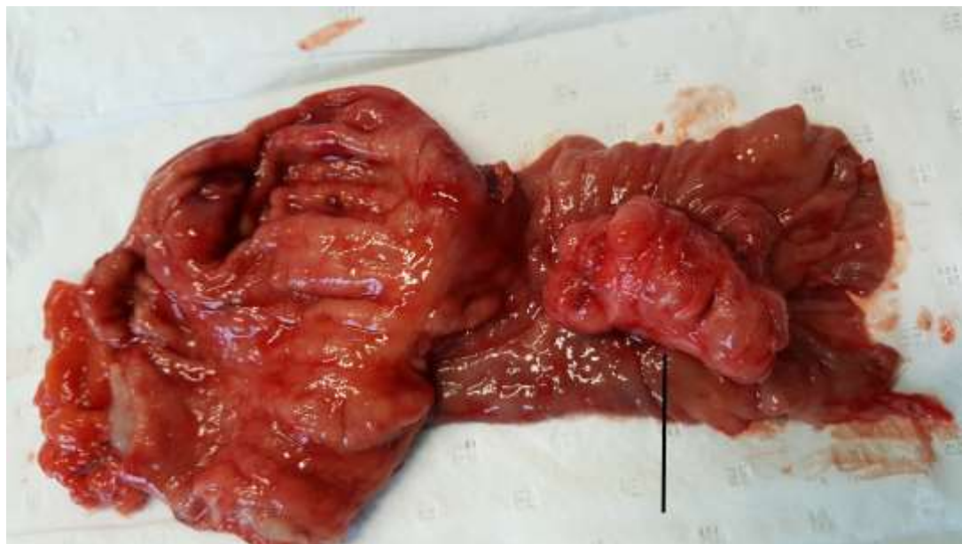
Figure 3. Postoperative view. The arrow shows the excised specimen with GIST tumor