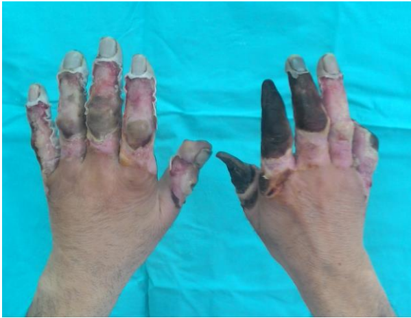
Figure 1. Frostbite of the hands