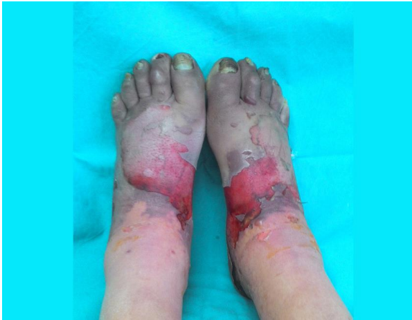
Figure 2. Frostbite of the feet