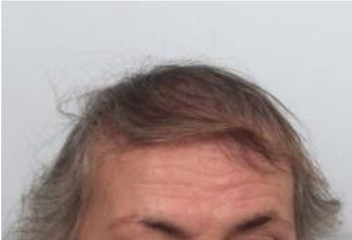
Figure 3. The same patient 10 months after transplantation