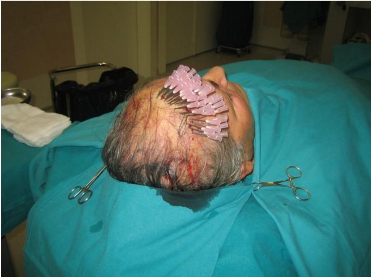
Figure 1. Needles are inserted in the direction of hair growth