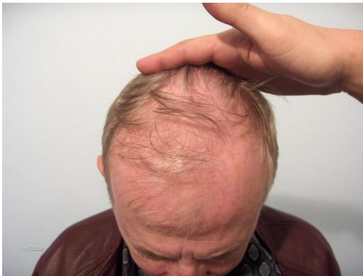
Figure 4. Patient before surgery