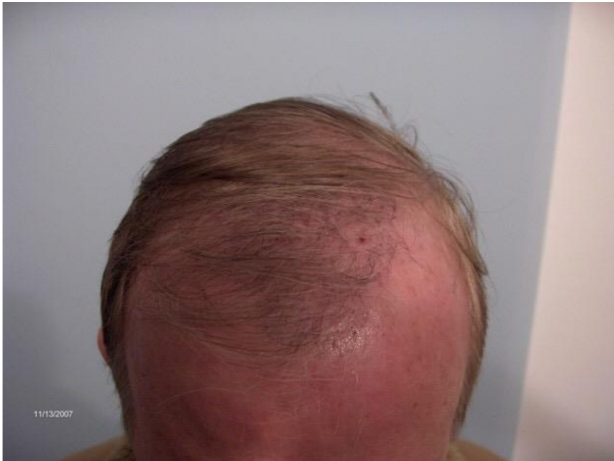
Figure 5. The same patient seven months after surgery