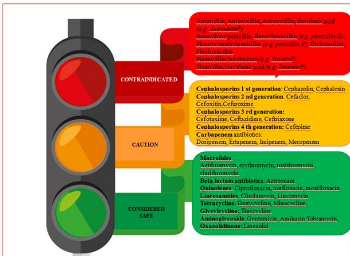
Figure 2. Penicillin allergy [7]