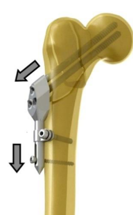
Figure 3. Self-dynamizing internal fixator according to Mitković