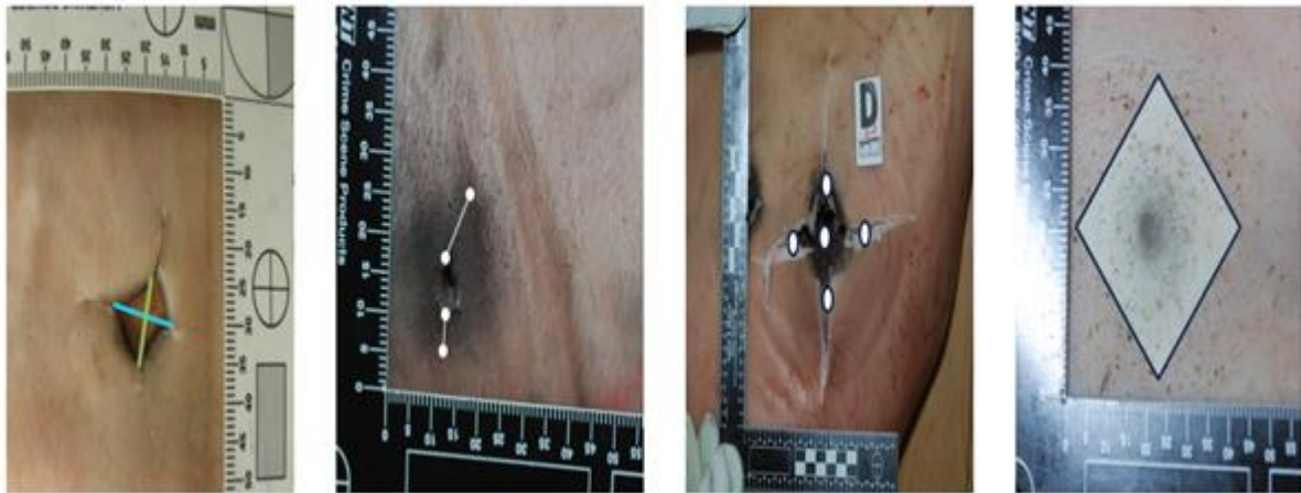
Figure 4. Examined characteristics of the wound

Dimensions of the wound, contusion ring and the scattering area of gunshot powder particles were measured after shooting. Based on these dimensions we have calculated the wound area.