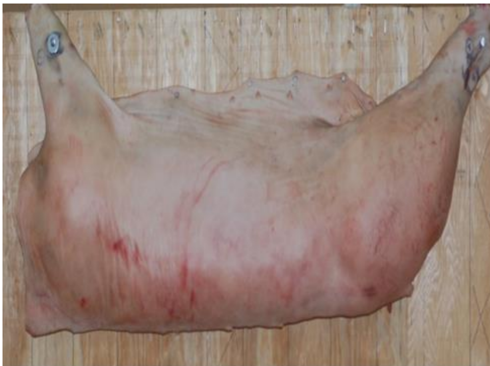
Figure 1. Pig as a subject is used in this study due to its similarity with human skin