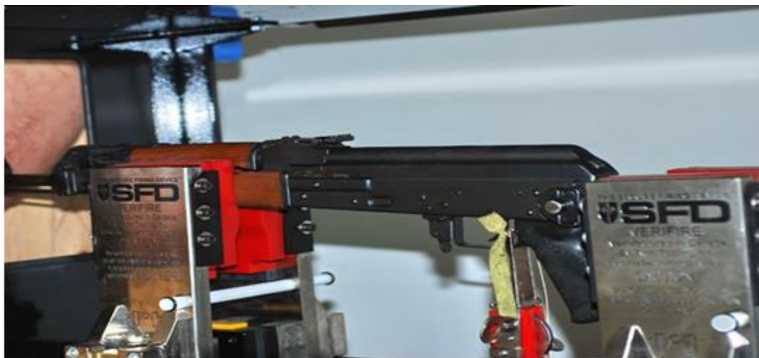
Figure 3. System Verifier-The Secure Firing Device, Twin Tooling, Canada