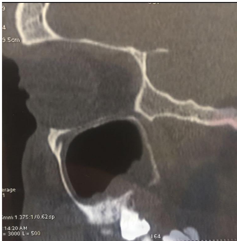
Figure 2. Computed tomogram of patient S; before surgery: the defect of the alveolar process of the right upper jaw, the fistula of the right maxillary sinus with the oral cavity, and thickening of the sinus mucosa are visualised