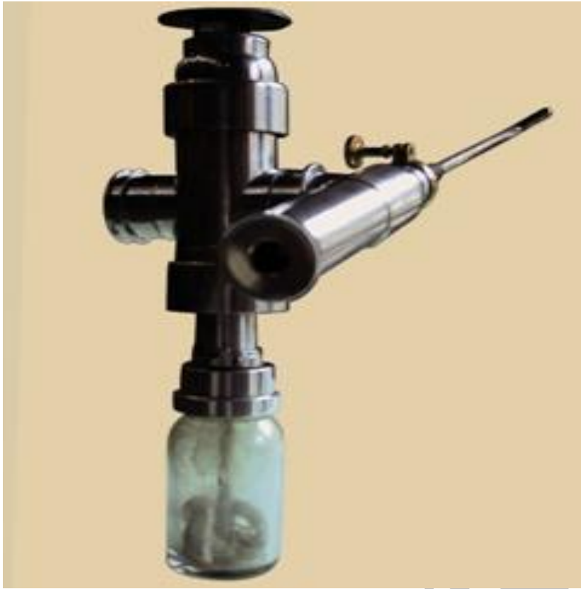
Figure 2. Desormeaux's endoscope