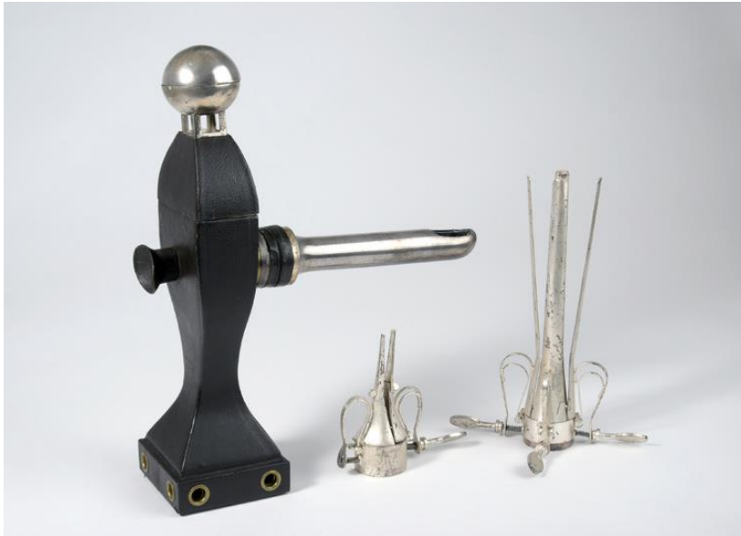
Figure 1. Bozzini's Lichtleiter or light conductor