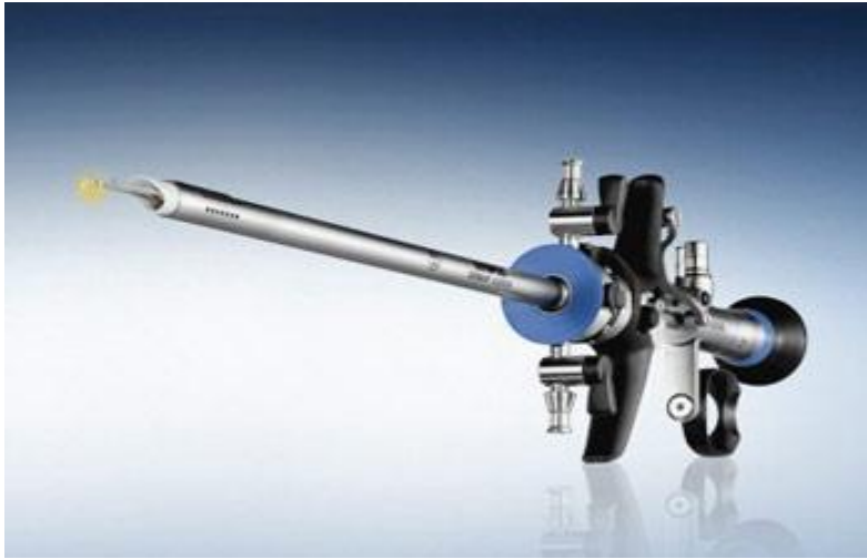
Figure 5. Olympus bipolar resectoscope