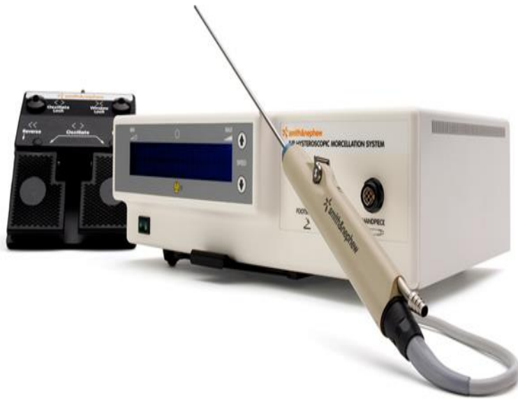
Figure 7. TRUCLEAR hysteroscopic morcellator