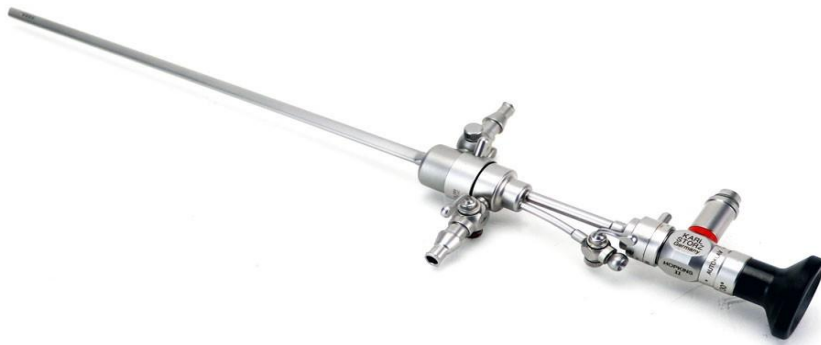
Figure 4. Bettocchi office operative hysteroscope