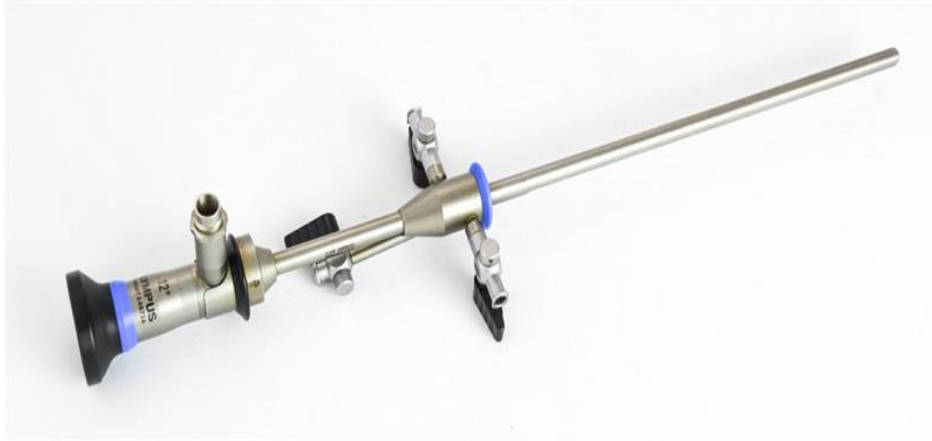
Figure 3. Rigid hysteroscope