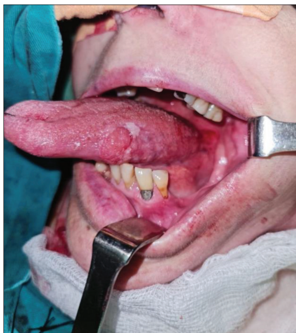
Figure 1. Oral squamous cell carcinoma of the tongue

The pathohistological analysis of postoperative OSCC preparations was done after the fixation of the preparations