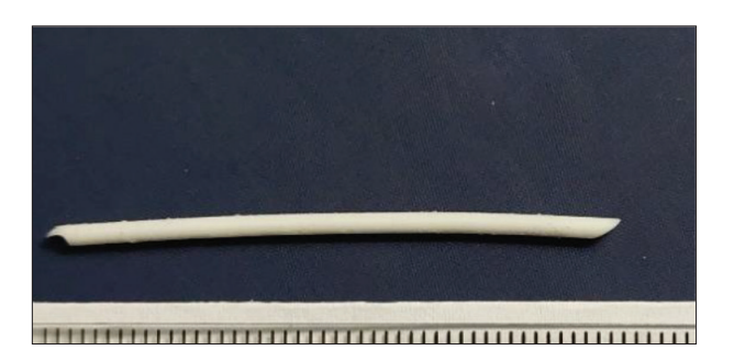
Figure 3. Part of Hickman catheter 4.5 cm long

for the next five days. The child was afebrile and hemodynamically stable. On the third postoperative day, he was extubated, and oral intake was started. Postoperative laboratory results on discharge were normal, and the child was transferred to the hematologic ward for further treatment.