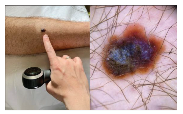
Figure 7. Spitzoid melanoma in a 20-year-old man