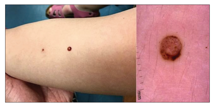
Figure 6. Spitzoid melanoma in a three-year-old girl