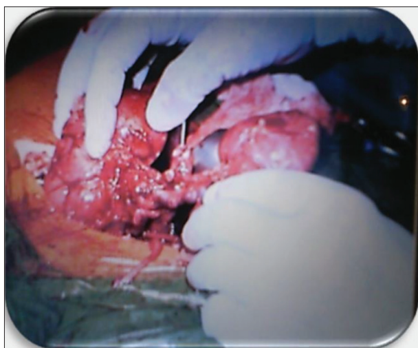
Figure 1. Kidneys transplanted using the en bloc surgical technique, after the creation of vascular anastomoses and established reperfusion