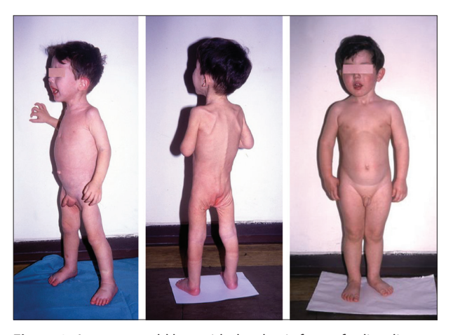
Figure 2. A two-year-old boy with the classic form of celiac disease; on the left and in the middle in the diagnostic phase, and on the right after 12 months of a gluten-free diet and the first two weeks of lactose restriction; the images in the diagnostic phase, along with the typical clinical aspect, show hypoproteinemic edema on the lower extremities, conspicuous loss of muscle and fat tissue in the gluteal region ("tobacco bag phenomenon") and perianal erythema as a consequence of secondary lactose intolerance (original recordings were made by the authors with parental permission and consent)

form of the disease is characterized by chronic diarrhea followed by malabsorption and secondary malnutrition, while the clinical picture of the non-classical disease is dominated by extraintestinal manifestations [1, 2, 17, 22, 23]. The classic form of the disease is most often seen in infants and young children, and the non-classic in later ages and in adults [11, 17, 23]. In the symptomatic form of the disease, along with evident enteropathy, autoantibodies to tissue transglutaminase (AtTG) and EMA, as well as the HLA DQ2 and/or DQ8 genotype, are almost regularly registered [1, 2, 12, 33, 35]. However, despite the presence of all these indicators, in most cases, CD remains unmanifest for a long time, and this form of the disease is called subclinical ("silent CD") [1, 2]. In addition, potential CD has an asymptomatic character, which differs from the