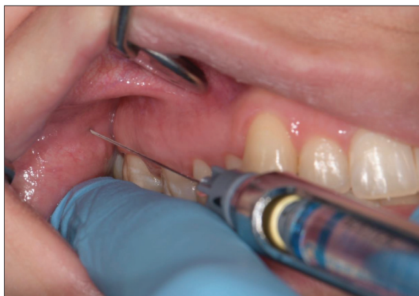
Figure 1. The puncture site and needle direction for modified Vazirani–Akinosi technique