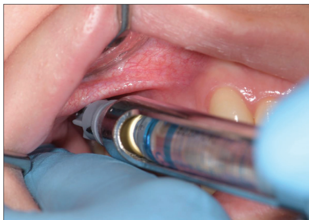
Figure 2. Deposition of the first dose of anesthetic solution (0.6 ml) at a depth of 25–30 mm within the pterygomandibular space