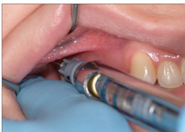
Figure 3. Deposition of the second dose of anesthetic solution (0.6 ml) at a depth of 20–25 mm within the pterygomandibular space