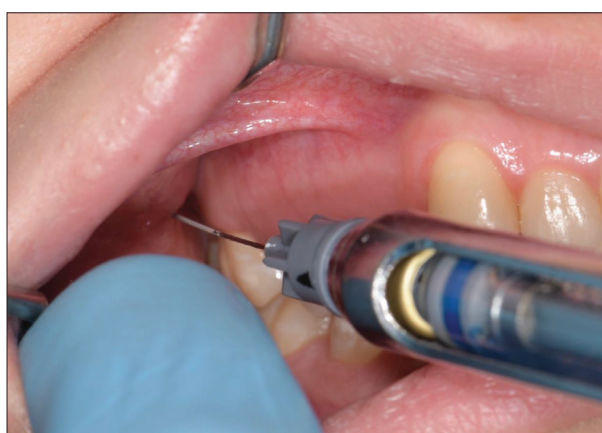
Figure 4. Deposition of the third dose of anesthetic solution (0.6 ml) at a depth of 15–20 mm within the pterygomandibular space

targeted nerves, and it was confirmed objectively, i.e., by a pin-prick test performed by the doctor. The test implied light pricks of mucosa in innervation zones of the targeted nerves with the dental probe. The width of the anesthetized area was considered adequate if the anesthesia included the innervation zones of IAN, LN, and BN. The injection was repeated before the surgery if failure to obtain adequate anesthesia occurred. If the failure implied only inadequate anesthesia in the BN innervation zone, only an additional BN block was administered. Cases that did not require any additional injection were considered successful.