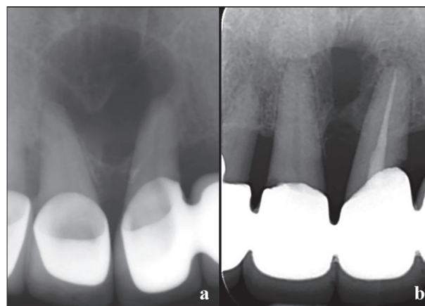
Figure 1. a – preoperative retroalveolar radiograph showing a cystic lesion between roots of the central incisors; b – the 3-year follow-up retroalveolar radiograph showing reduced radiolucency; 900 pixels wide (300 PPI)

were made. The lesion was located along the incisive canal and extended from the nasal floor to the edge of the alveolar ridge between the upper central incisors. The apices of both upper middle incisors were surrounded by bone, but also projected into the lesion. Careful enucleation of the cyst was performed without extraction of adjacent teeth, and on the surgical site ADSCs and PRP were applied and covered with collagenous resorptive membrane Evolution (OsteoBio®, Torino, Italy) and PPP.