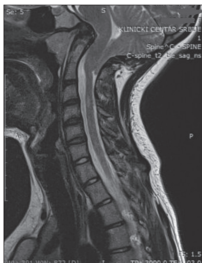
Figure 2. The first follow up magnetic resonance imaging, before the first surgery