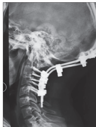
Figure 4. Postoperative X-ray

Follow up nuclear MRI was performed (Figure 2) following the first hospitalization and the findings were unchanged and the neurosurgical procedure (suboccipital craniectomy and decompression) was performed. Approximately one-year post-op the patient presents with following symptoms: headache, left arm paresthesia eventually followed by left side hemiparesis. New multislice computed tomography and MRI scans were obtained and showed progression of syringomyelia expanding cranially to syringobulbia, decompression in posterior cranial fossa was still intact. Two months later the symptoms persisted and new MRI scans were obtained – in comparison with former scans progression of hydrosyringomyelia was observed, as well as expanded central medullar canal with oedema. Conservative treatment was tried with antiedema therapy, but there was no clinical improvement. The patient was hospitalized again and another MRI evaluation was performed, and neurosurgeon and orthopedic spinal surgeon indicated OC stabilization.