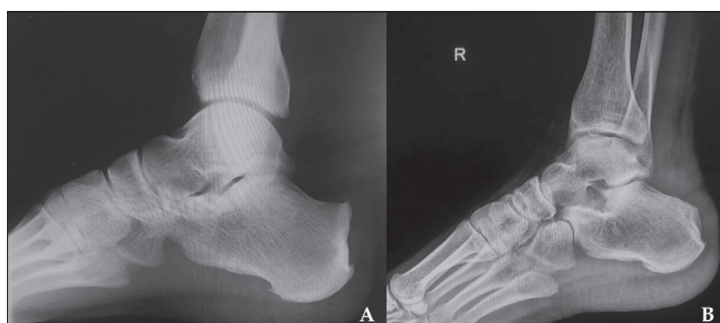
Figure 2. A) Pre-operative lateral radiograph; B) postoperative lateral radiograph

matory drugs and physical therapy. We did not decide to administer local corticosteroid therapy due to the possibility of Achilles tendon rupture, which was published in some earlier studies [6, 8, 9]. After the unsuccessful eight-month-long non-surgical treatment, we decided to perform the arthroscopic surgery with a three-portal technique, a slightly newer technic that has been in use for less than a decade [4, 9].