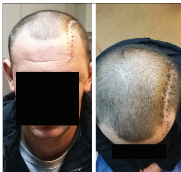
Figure 4. Restoration of head shape after the operation – pleasurable esthetic result

initial phase and achieving enough hardness not to deform, the mold was opened, allowing final stages of polymerization to occur outside of the mold and thus avoiding deformation of mold or implant. Multiple punctuations were made in the implant, allowing evacuation of potential fluid collection, as well as soft tissue ingrowth, obliterating potential epidural space (Figure 2). Fixation was achieved using CranioFix® (Aesculap®, Center Valley, PA, USA), epicranial drain was left in place, and soft tissue reconstruction was performed in anatomical layers. There were no intraoperative complications during prosthesis molding or implantation. After surgery, aesthetic results were obvious, and the patient was without new neurological deterioration (Figures 3 and 4). Initial CT scan demonstrated epidural effusion of non-blood liquid, without compressive effect (Figure 5). Local punctation was performed, and fluid, which was a mixture of blood and saline, was drained. Following punctation, an immediate control scan