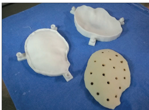
Figure 2. Two-part polyamide mold made by laser printing technology and the resulting polymethylmethacrylate graft shaped by manual mold compression

powder and raising the quality of surfaces, and additional polishing of the inner surfaces of the mold for easier separation of the mold and the implant. Time consumed for 3D modeling, printing, and post-production processing was eight days, and the estimated cost per patient was €550–€600.