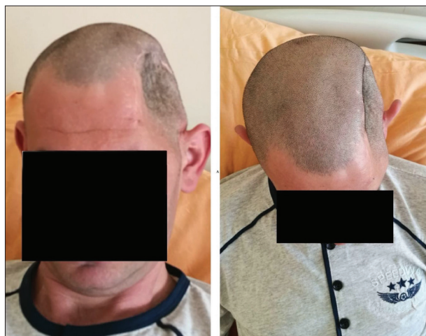
Figure 1. Patient with large hemicranial defect before surgery