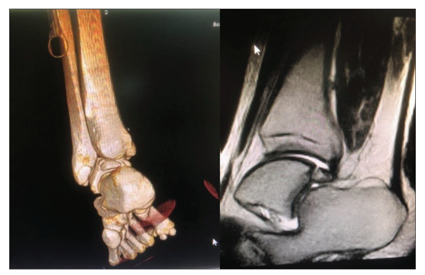
Figure 1. Computed tomography and magnetic resonance imaging showed posterior talar process fracture