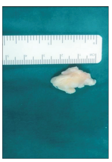
Figure 3. The free body was removed through the posteromedial portal