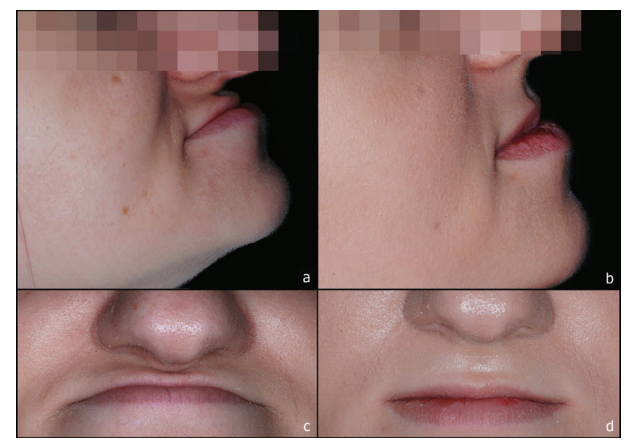
Figure 5. a – initial extraoral profile view, mandibular prognathism with maxillary hypoplasia; b – facial appearance after prosthodontic rehabilitation and restored vertical occlusal dimension; c – labial philtrum and upper lip before the prosthodontic treatment; d –after the treatment

Authors stated that OI type III was the most severe form in children which survive the neonatal period [16, 22]. These patients, along with OI type IV, require special dental care from the primary dentition [21]. Malocclusions are frequent finding in OI patients, especially class III [8, 23]. The malocclusions are caused by maxillary hypoplasia, mandibular prognathism or a combination of both factors. In addition, abnormal bone growth, posture, head size might be contributing factors to the development of malocclusions, which may become more serious with time [20]. Malocclusions can impair everyday activities such as chewing and speaking and consequently have negative impact on the quality of life, which was one of the main concerns of our patient [12, 24].