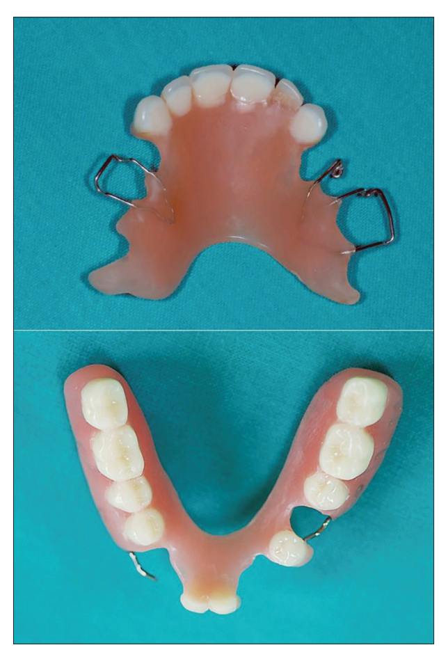
Figure 3. Maxillary and mandibular partial removable dentures

proper oral and denture hygiene. An appointment was scheduled after a week for final adjustments and, after that, she was examined after three, six, and 12 months. She was satisfied with the functional improvement and with the aesthetic outcome of the treatment (Figure 5). The removable partial dentures did not need realignment after a year.