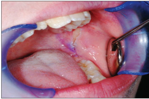
Figure 1. Deep aphthous change treated with gentian violet