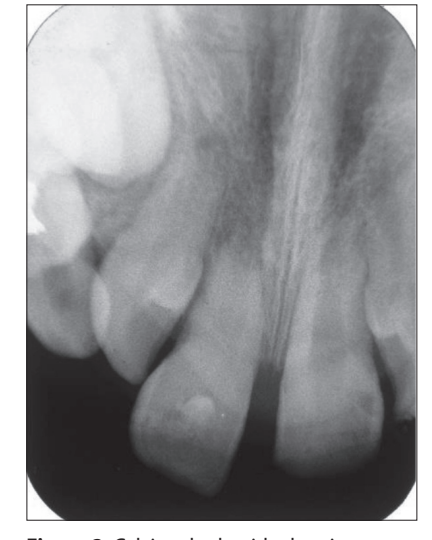
Figure 2. Calcium hydroxide dressing