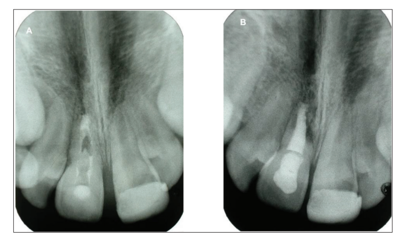
Figure 4. Definitive obturation with: (A) MTA; (B) root canal sealer and gutta-percha

Calcium hydroxide was removed and the apical portion of the canal was filled with mineral trioxide aggregate (ProRoot MTA, Dentsply Tulsa Dental, Tulsa, OK, USA;