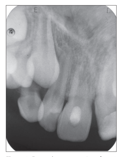
Figure 3. External root resorption after 18 months

Replantation of the avulsed permanent tooth was performed after three-hour dry storage at the public health service facilities (Figure 1) and the injured tooth was stabilized at our clinic with a passive, flexible acid-etched composite splint after a total of 14 hours. Although tetracycline was recommended, the girl was placed on 250 mg of penicillin to be taken every six hours for one week. Tetanus coverage was evaluated and suitable oral hygiene and dietetic regime were recommended. Informed parental consent for the future treatment was obtained in writing and consent was also obtained from the child.