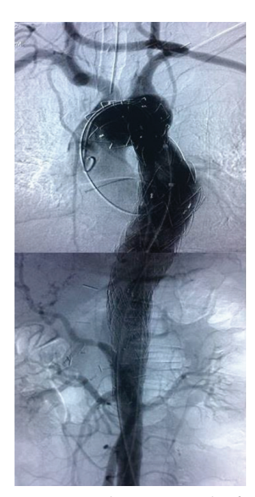
Figure 2. Completion angiography after thoracic endovascular aortic repair