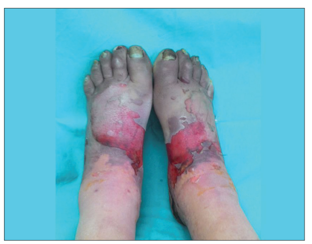
Figure 2. Frostbite of the feet

To represent the temperatures at which frostbite had been sustained, we used the lowest daily temperature recorded by the closest weather station from the location of the injury on the day of frostbite. Mean daytime temperatures were classified in intervals -20--15°C; -15-10°C; -10--5°C; -5-0°C; and 0-5°C.