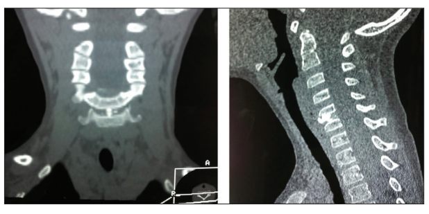
Figure 2. Computerized tomography scan of cervical spine without contrast; calcified lesion between C4 and C5 vertebrae

sistent and with no pathological changes. There were signs of sclerosation of the inferior plateau of the C4 vertebral body and on the superior plateau of the C5 vertebral body.