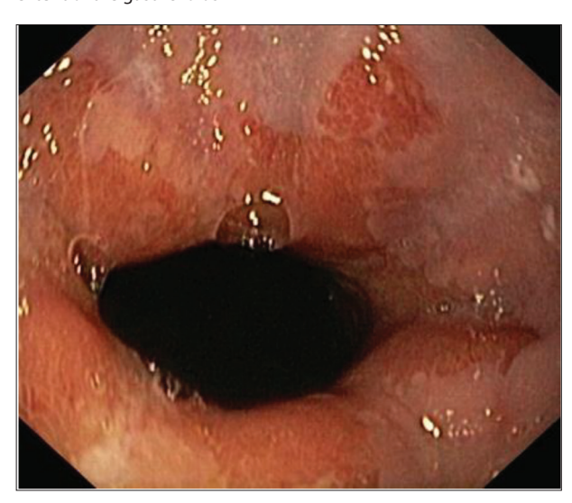
Figure 2. Salmon-colored mucosa is seen extending proximal to the gastroesophagel junction consistent with Barrett's esophagus