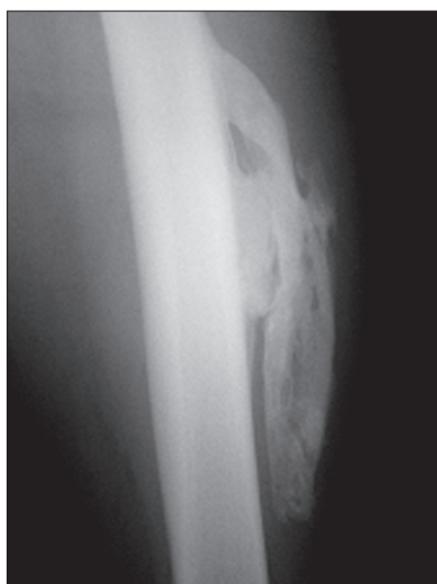
Figure 4. Lateral radiograph four months after the initial injury