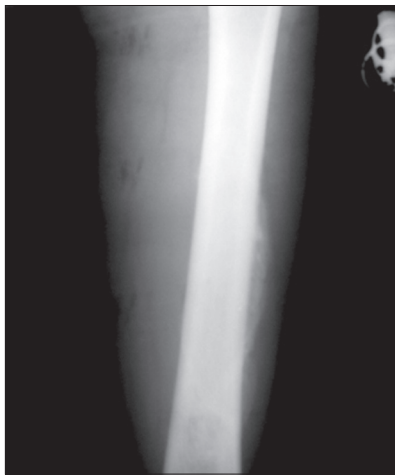
Figure 1. Anteroposterior radiograph of the femur obtained two months after the initial injury