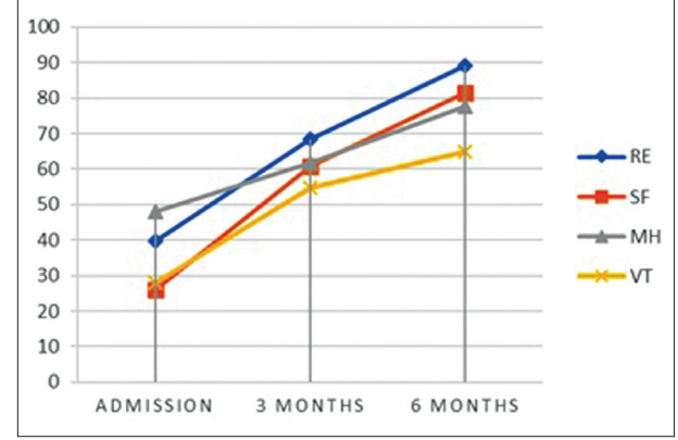
Figure 2. Four basic domains of the Mental Health Composite Scale score change over six months after surgery; RE – role of emotional functioning; SF – social functioning; MH – mental state; VT – vitality

SF-36v2<sup>*</sup> contains 36 questions, issues that include the following eight fields of the QL: physical functioning (PF), the role of physical function (RF), the role of emotional functioning (RE), social functioning (SF), bodily pain (BP), mental state (MH), vitality (VT), a subjective feeling of health (GH). By further grouping into four areas, two summary scores were obtained: physical (PCS) and mental (MCS). The formula for the calculation of the summary scores included the values of all eight single domains and four basic for each of the summary scores (Figures 1 and 2). The minimum score value was zero, and the maximum was 100 – higher score value signifies better QL.