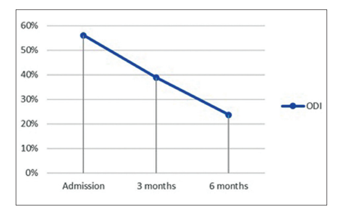
Figure 3. Values of the Oswestry Disability Index score change over six months after surgery

SF-36 – Medical Outcomes Study Short Form 36; PF – physical functioning; RF – role of physical function; RE – role of emotional functioning; SF – social functioning; BP – bodily pain; MH – mental state; VT – vitality; GH – subjective feeling of health; I – admission; II – 3 months; III – 6 months; a – Switzerland; b – United Kingdom; c – USA; d – China; e – Australia [6]