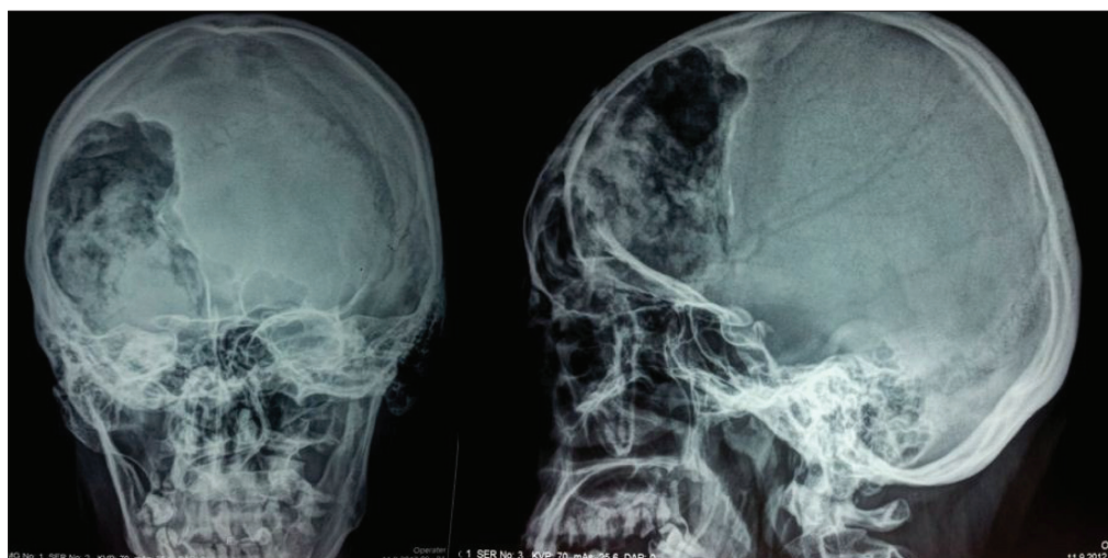
Figure 1. Skull X-ray showing extradural lytic bone lesion.

A routine X-ray of the skull was made and lesion of the frontal bone was detected (Figure 1). A magnetic resonance imaging (MRI) brain scan showed an enhancing extradural lytic bone lesion of 6.16 × 7.21 cm in size, well-defined hyperdense, on T2-weighted image, mass lesion in the right frontal lobe without perilesional edema (Figure 2). Preoperative cerebral