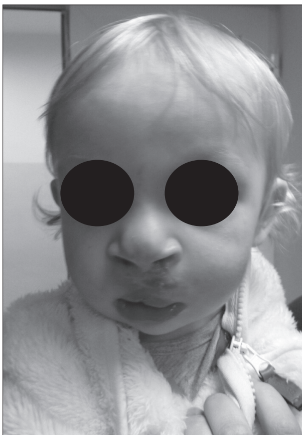
Figure 5. The patient at the age of 16 months

margins remain fused until the fifth gestational month and may not be completely separated until the seventh month, but they should be separated before birth [13]. The etiology of AFA is unknown. One of the factors that have been suggested is the failure of apoptosis at a critical stage in eyelid development [15]. AFA is a condition which arises due to the interplay of temporary epithelial arrest and rapid mesenchymal proliferation, allowing for the union of the lids at certain points [17].