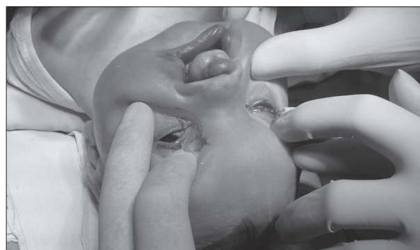
Figure 4. Separated eyelids after the surgical procedure

The ophthalmic follow-ups were carried out at the age of six, nine, and 16 months. Visual acuity assessment