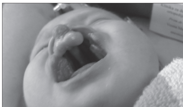
Figure 3. The newborn with AFA and cleft lip and palate

After the consultative examination by a specialist in orthodontics, an appropriate orthognathic prosthesis was made to enable smooth feeding of the newborn. Surgical treatment of the bilateral cleft lip and palate was performed later.