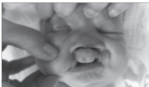
Figure 2. The newborn with AFA and cleft lip and palate