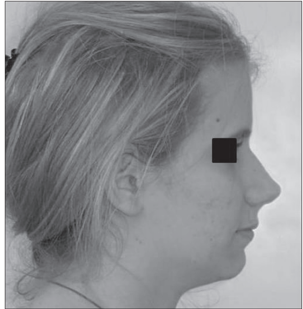
Figure 2. A patient's profile photograph after the treatment