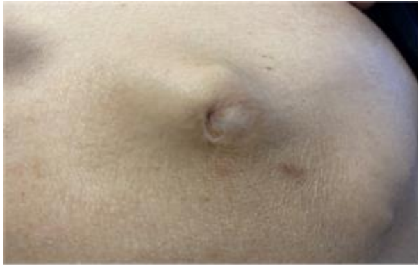
Figure 1. Clinical presentation of implantation metastasis- subcutaneous nodule in the anterior chest wall in the area of scar after percutaneous transhepatic biliary drainage procedure