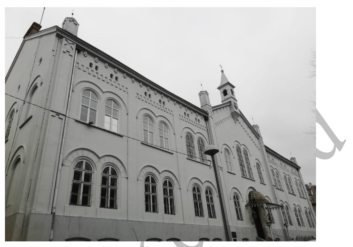
Figure 2. Current appearance of the building of the Serbian Medical Society, formerly the General State Hospital, at 19 George Washington Street; source: Korugić A, 2024, personal archive