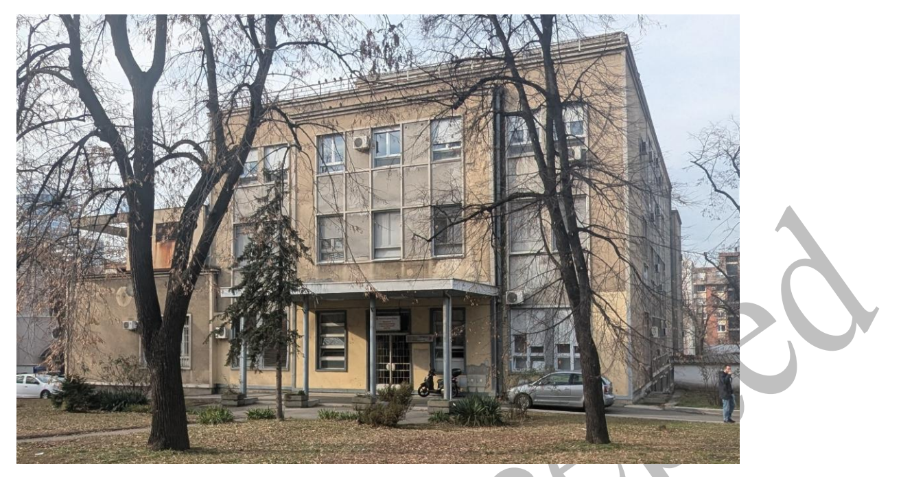
Figure 3. The current building of the Clinic for Otorhinolaryngology and Maxillofacial Surgery on Pasterova Street