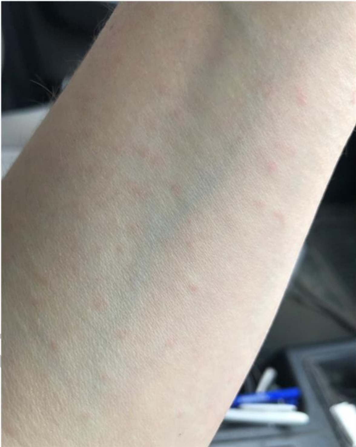
Figure 3. The rash on the forearm