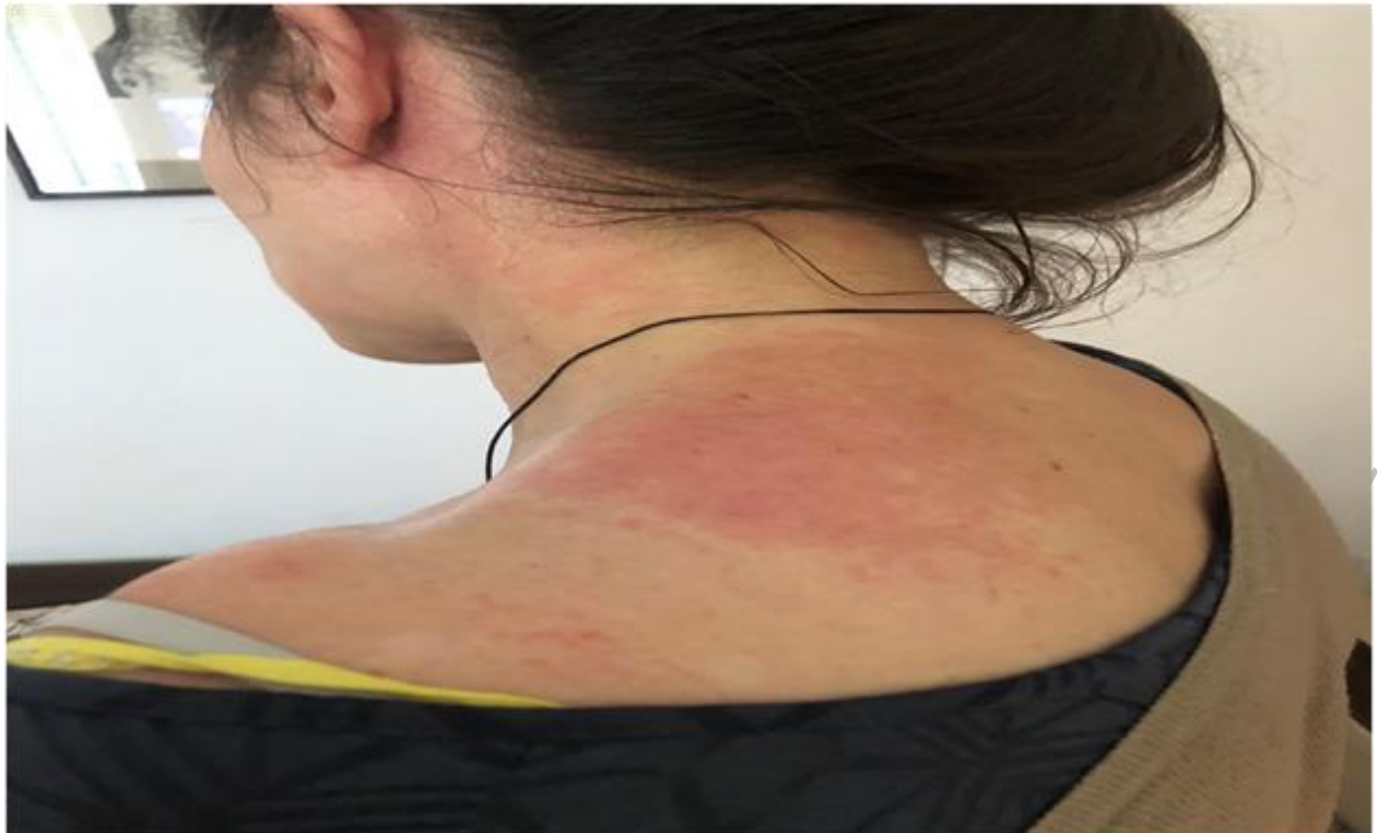
Figure 1. Erythematous confluent plaques on the neck and upper part of the chest