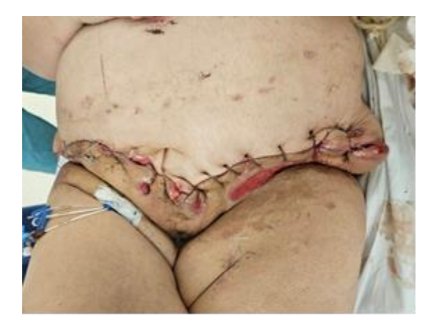
Figure 4. The wound is completely closed

DOI: https://doi.org/10.2298/SARH240921083K