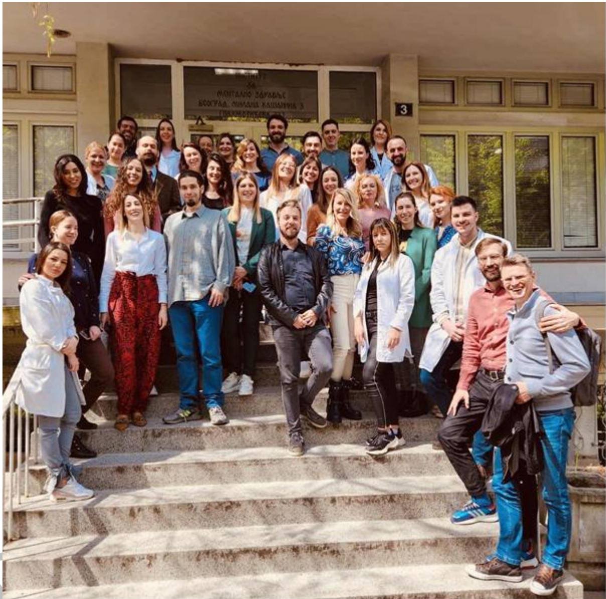
Figure 4. The future of Institute of Mental Health - young specialists, residents and psychologists of the Institute