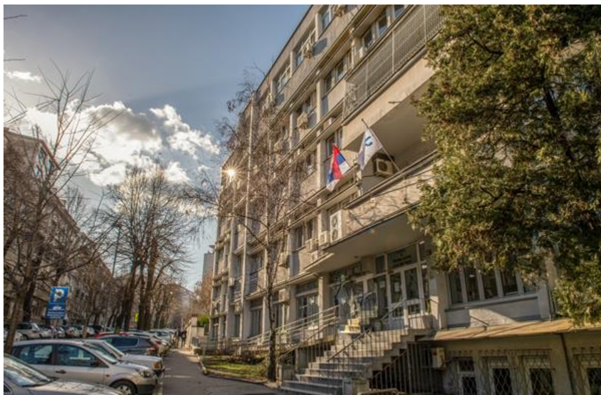
Figure 1. The Institute of Mental Health, 2023