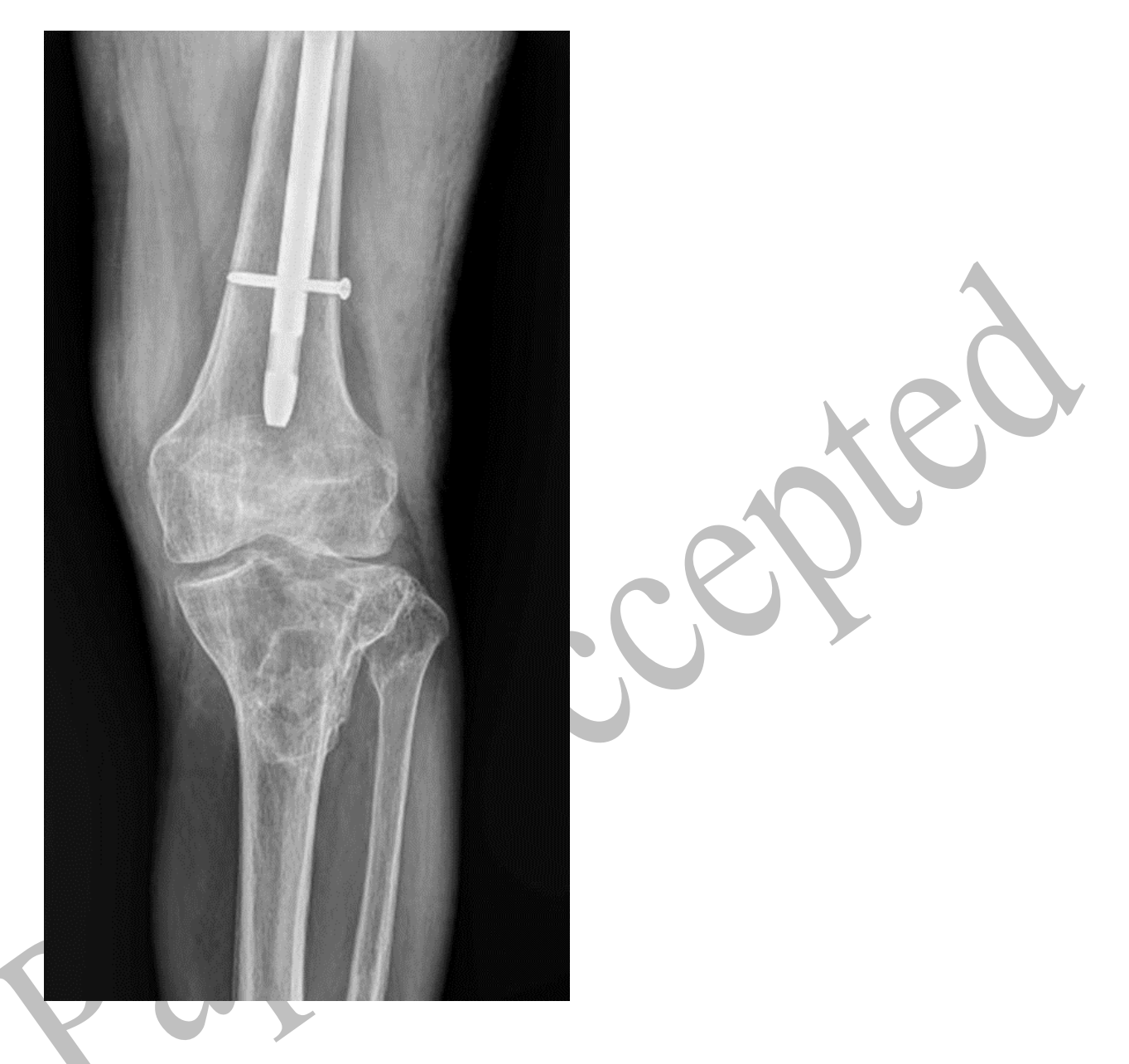
Figure 5. Radiography of the left thigh and knee six months after surgery