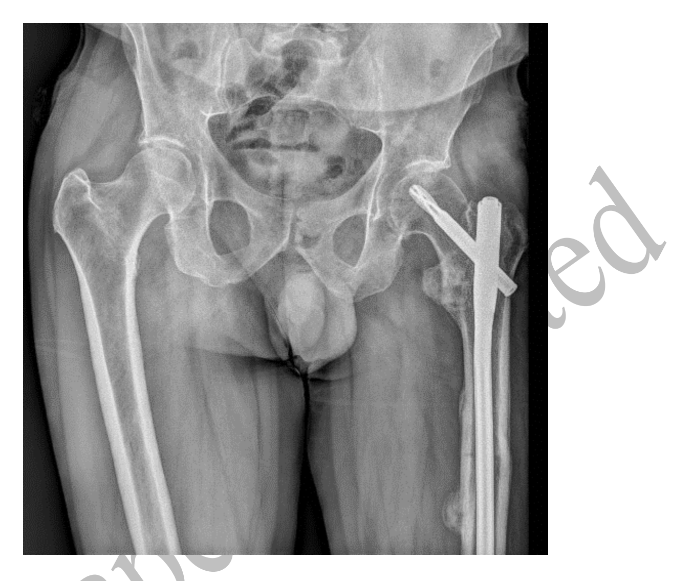
Figure 4. Radiography of the left hip and thigh two months after surgery