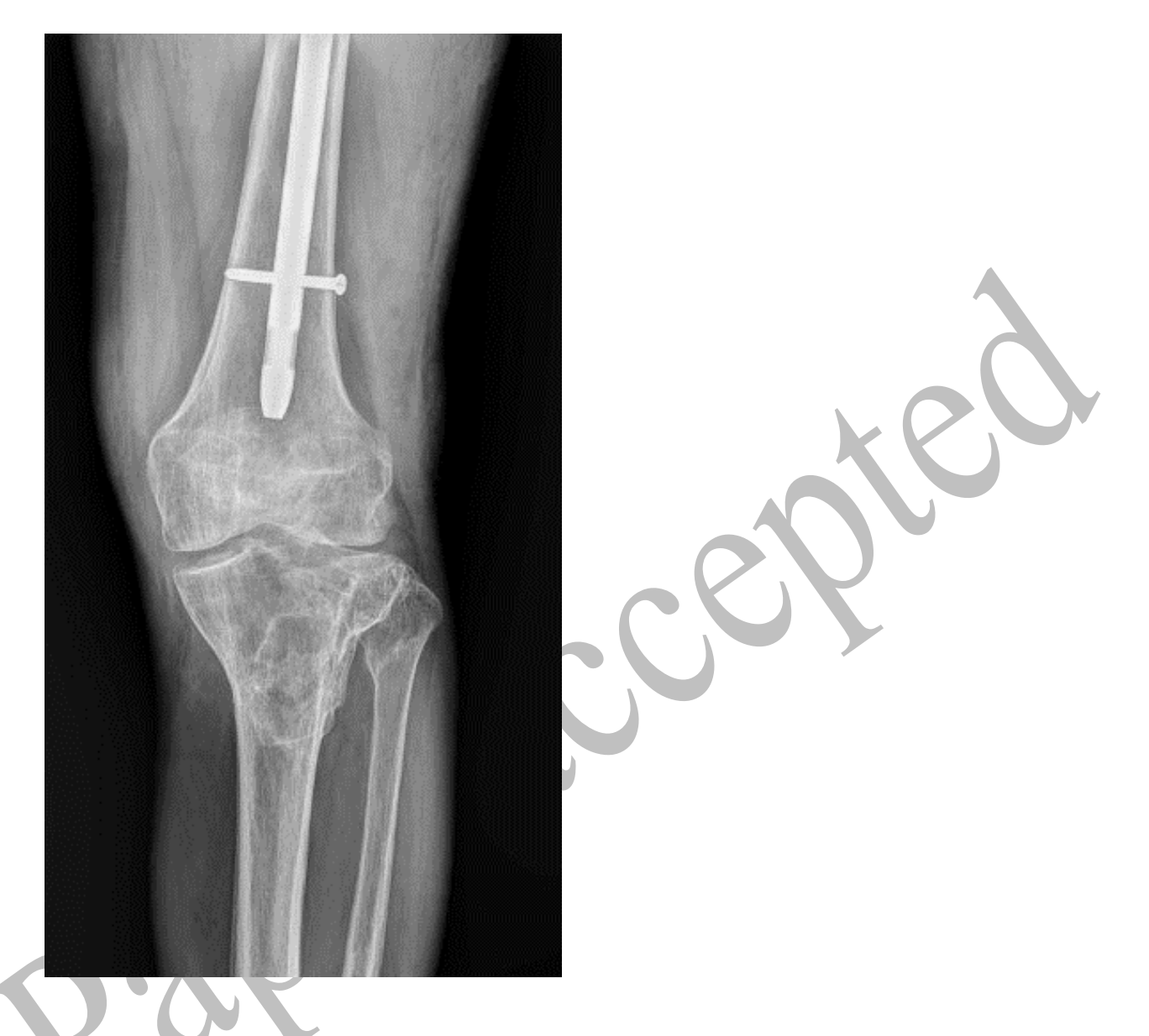
Figure 3. Radiography of the distal end of the femur and the knee joint on the first postoperative day