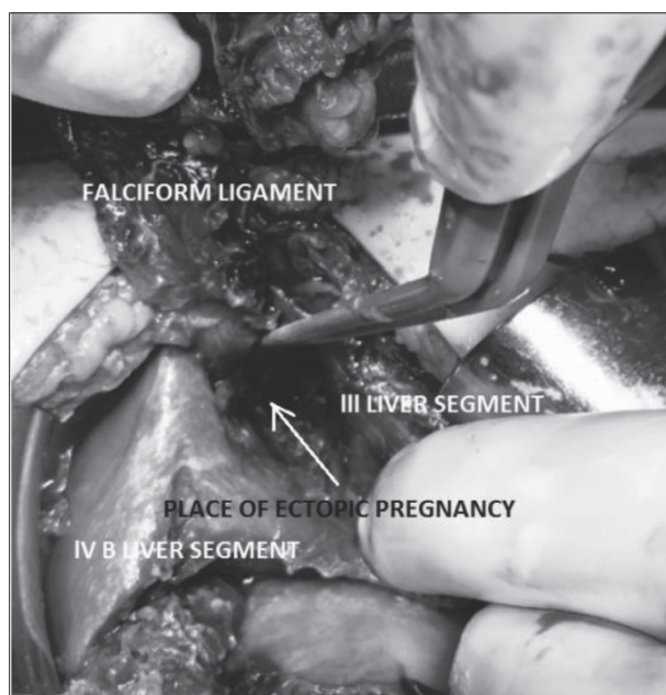
Figure 3. Intraoperative findings: segment III of the liver and place of the ectopic pregnancy next to segment IV of the liver below the falciform ligament after the expulsion of the ectopic pregnancy from the liver cavity