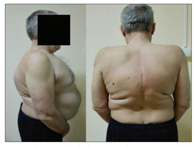
Figure 4. The patient has kyphosis in upright posture (since childhood); after the operation, patient can stand alone and walk with a cane; pronounced gibbus is seen in the thoracolumbar region; on the right picture a scar from surgery in the thoracolumbar region is visible

canal narrowing by granulation tissue, abscesses, or direct dural invasion resulting in spinal cord compression and neurologic deficits [2].