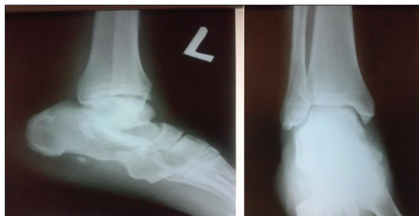
Figure 3. X-ray images after dislocation of the cuboid bone