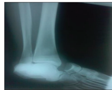
Figure 2. X-ray image of subtalar dislocation

The mechanism of injury was different. In cuboid dislocations, one subtalar and two tarsometatarsal, injury occurred in a traffic accident. In dislocation of the navicular bone, the injury was caused by a jump from the height and in three subtalar dislocations, injury was sustained during the sports activities. In four tarsometatarsal dislocations, the injury was sustained by the fall. Four patients were treated surgically.