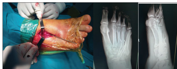
Figure 7. Intraoperative photos tarsometatarsal dislocation after the open reduction and K-wire stabilization and postoperative X-ray image