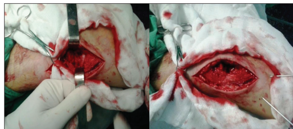
Figure 6. Intraoperative photos of dislocations of the navicular bone and photos after the open reduction and K-wire stabilization

In the first injury, an excellent functional result was achieved. In the second injury an intensive physiotherapy was applied. Satisfactory functional result was achieved with the presence of the pain. The patient marked the pain with 3 on the visual analogue scale and also experienced limited joint mobility of the ankle and foot more than one