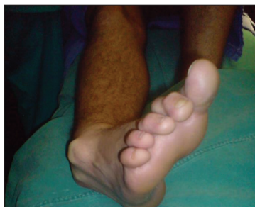
Figure 1. Subtalar dislocation of basketball players