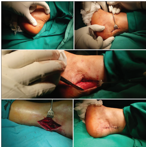
Figure 1. Steps in surgery: position for surgery; surgical approach; Achilles tendon location; Achilles tendon rupture; postoperative suture

variability analyzed data; odds ratio, probability) and analytical statistics (distribution normality test Kolmogorov–Smirnov test; \chi^2 test; t-test; linear and logistic regression; linear correlation; one way ANOVA; ROC analysis) using the SPSS, software package version 26.0 (IBM Corp., Armonk, NY, USA). Statistical significance was set as the value of p < 0.05 .