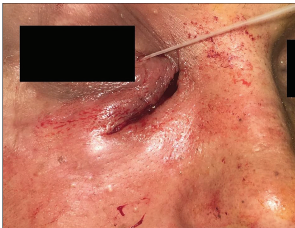
Figure 1. Condition after silicone single-channel tube placement; the photograph is used with the permission of the subject

Classic ext-DCR with mono or bicanalicular silicone intubation, depending on the clinical manifestation of DC, was performed in all patients. The purpose of the