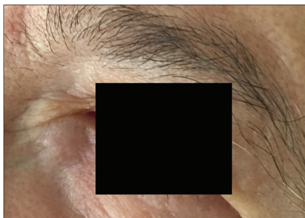
Figure 3. Chronic form of dacryocystitis; the photograph is used with the permission of the subject

In three patients after DCR, a recurrence of the disease appeared on average four weeks after the surgery. Initially, the patients in question were diagnosed with ADC, which was treated with broad-spectrum antibiotics and incisions. Given that microbiological findings indicated the presence of gram-negative bacteria, no recurrences were noted after the administration of therapy based on the antibiogram.