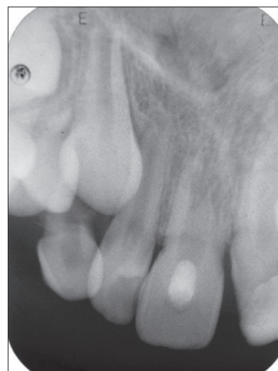
Figure 3. External root resorption after 18 months

Replantation of the avulsed permanent tooth was performed after three-hour dry storage at the public health service facilities (Figure 1) and the injured tooth was stabilized at our clinic with a passive, flexible acid-etched composite splint after a total of 14 hours. Although tetracycline was recommended, the girl was placed on 250 mg of penicillin to be taken every six hours for one week. Tetanus coverage was evaluated and suitable oral hygiene and dietetic regime were recommended. Informed parental consent for the future treatment was obtained in writing and consent was also obtained from the child.