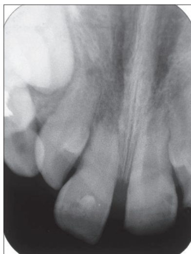
Figure 2. Calcium hydroxide dressing