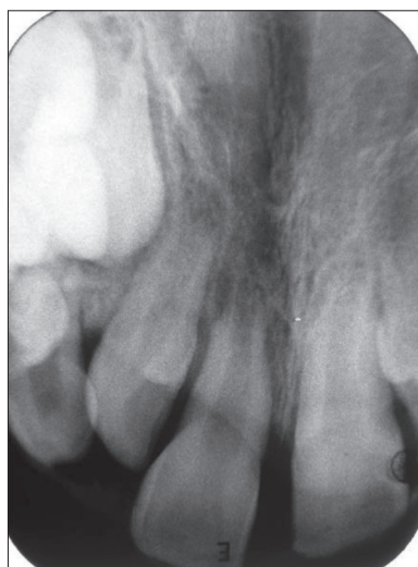
Figure 1. Initial radiograph