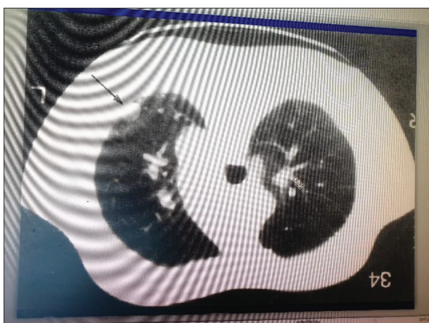
Figure 2. Multislice computed tomography of the thorax showed a lobulated, infiltrative change 16 × 16 × 11 mm in segment VI of the right lower lung lobe

computed tomography (MSCT) of the thorax showed a lobulated, infiltrative change 16 × 16 × 11 mm in segment VI of the right lower lung lobe, showing signs of infiltration of the surrounding parenchyma, followed by minimal pneumonitis (Figure 2). Video-assisted thoracoscopic surgery (VATS) was performed and a knot tissue sample 27 × 15 mm in size was obtained. Histopathological examination showed chronic granulomatous inflammation with necrosis similar to dirofilariasis. The patient was feeling well all the time and all his laboratory parameters were within reference values. Albendazole therapy was used for 28 days. In the further course of the disease, the patient lost all subjective symptoms, while the definitive suspicion of a malignant neoplasm was removed by the control MSCT thorax examination.