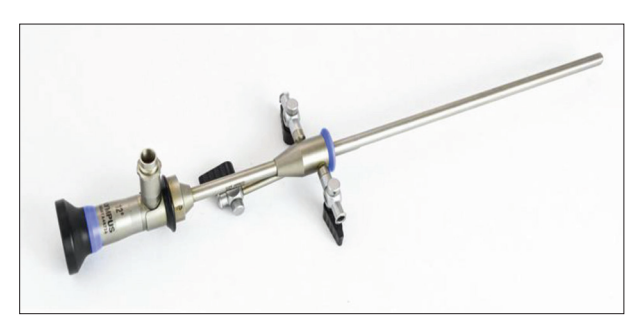
Figure 3. Rigid hysteroscope