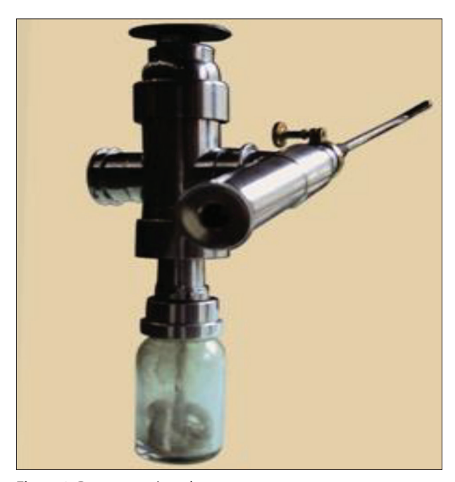
Figure 2. Desormeaux's endoscope

a lamp and a concave mirror as an illumination method (Figure 2).