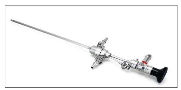
Figure 4. Bettocchi office operative hysteroscope