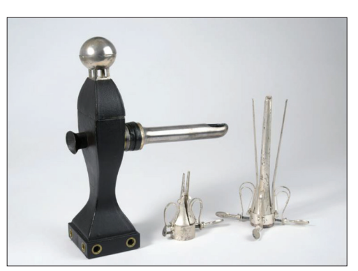
Figure 1. Bozzini's Lichtleiter or light conductor

Modern hysteroscopy originates from Philip Bozzini's articles in 1807 where he described the endometrial cavity, the existence of intrauterine tumours and malformations. He used a candle and a concave mirror as an illumination method (Figure 1). In 1853, Desormeaux developed the first cystoscope, and it was used to perform the first cystoscopy [2]. The cystoscope had two channels, one for introduction of liquids and the other for instruments. He used