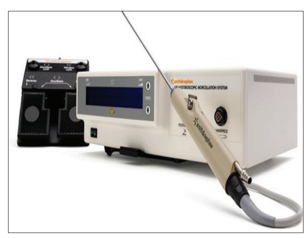
Figure 7. TRUCLEAR hysteroscopic morcellator

generator, as a source of monopolar and bipolar energy, which enables the utilization of the bipolar resectoscope in normal saline (Figure 6).