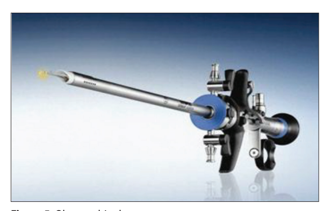
Figure 5. Olympus bipolar resectoscope

sodium chloride and Quinones-Guerrero (1976) used 5% dextrose [9, 10].