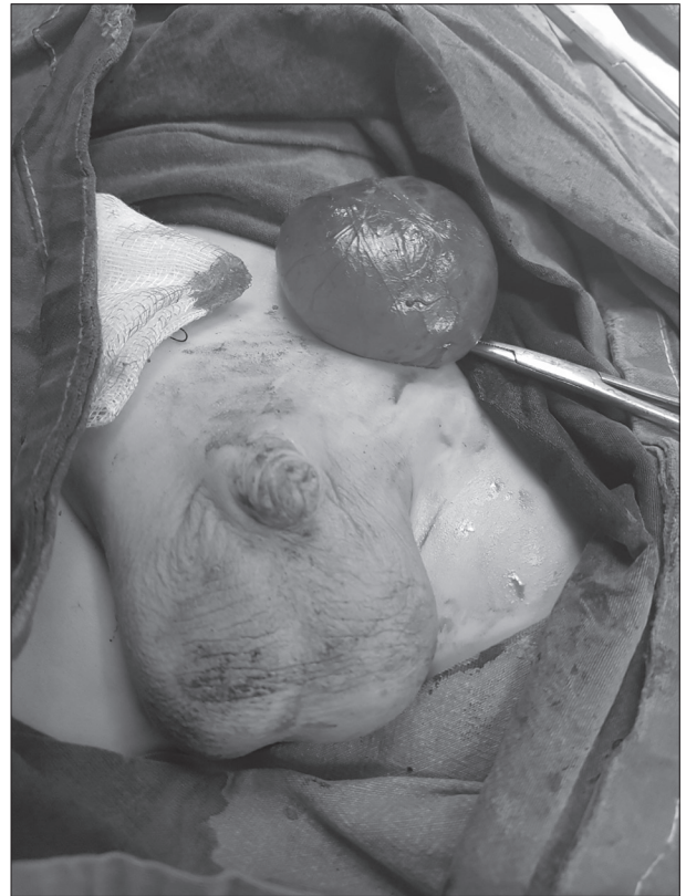
Figure 5. Operative finding after resection of left-sided abdominoscrotal hydrocele – abdominal component

pelvis were done when the patient was six months old. A 36-milimeter wide bilateral ASH was diagnosed, extending upwards through the inguinal canal into the abdominal cavity, with the diameter of 56 mm on the left side and 38 mm on the right side. The proximal part of hydrocele covered and compressed the urinary bladder. Since the hydroceles have grown from the previous examination, MRI of the abdomen and pelvis were performed. The MRI findings showed liquid deposits in the scrotum with a maximum diameter of 58 mm on the left side and 40 mm on the right